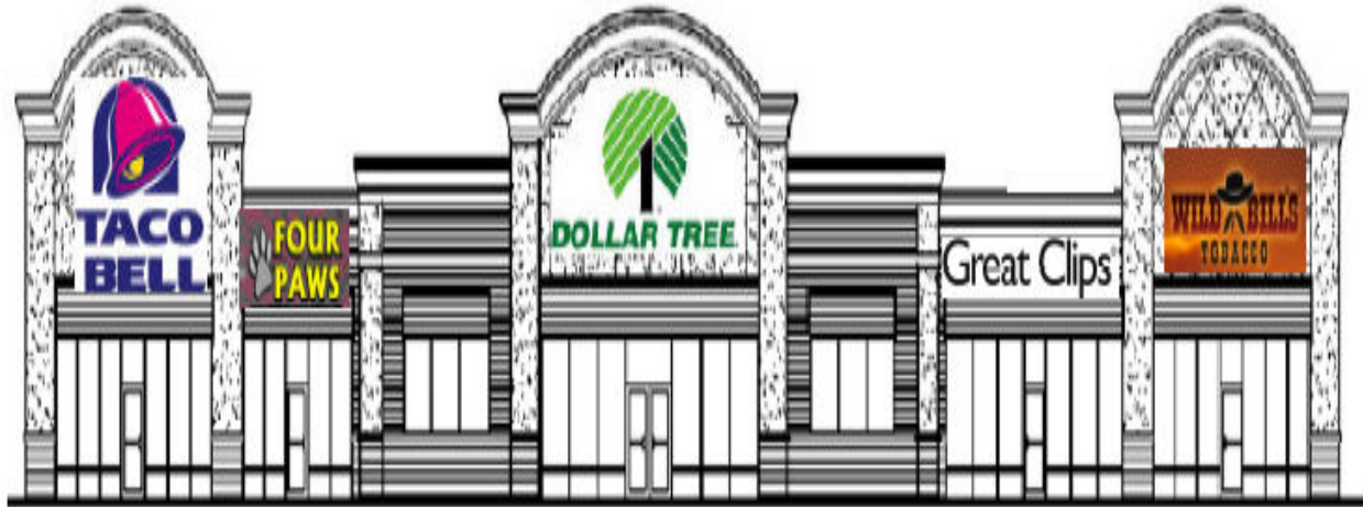
FRONT ELEVATION (OPTION 2)